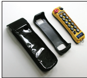
Protective rubber jackets and cases are available